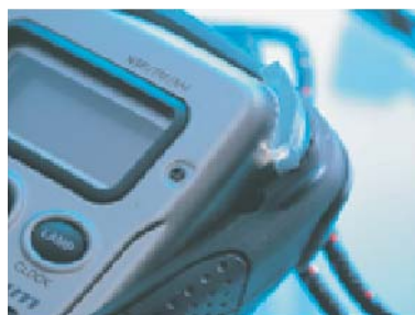
● outdoor radio