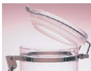
● durable \alpha GEL packing